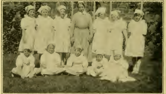
The Music Club of the Lankenau School presents a "Little Dutch Dance."